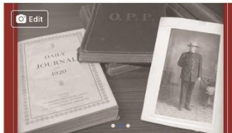
Friends of The OPP Museum @OPPMuseumFriends