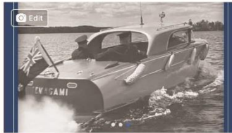
Friends of The OPP Museum @OPPMuseumFriends