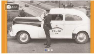
Friends of The OPP Museum @OPPMuseumFriends